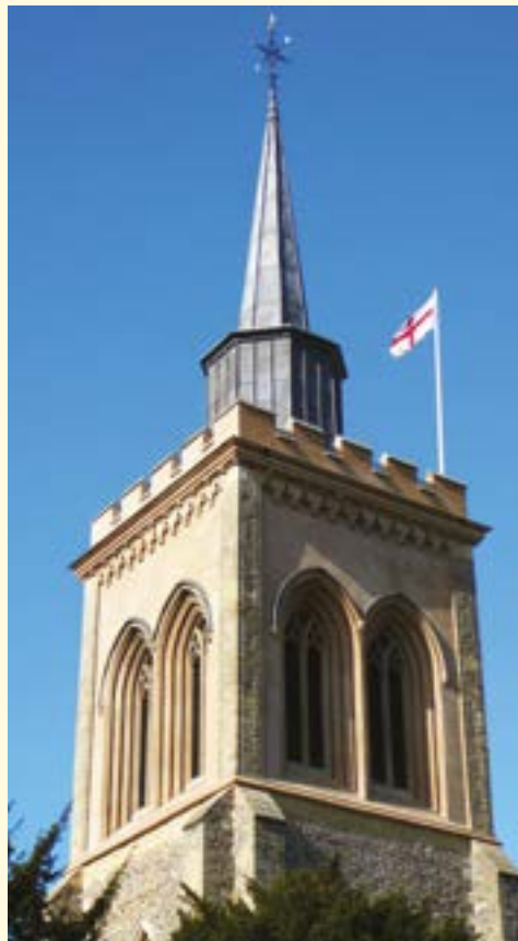
St. Mary, Baldock