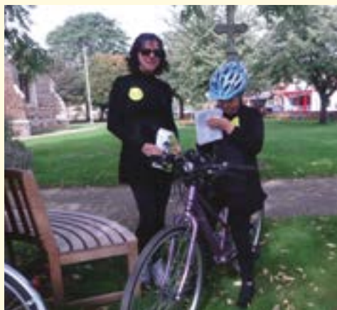
Signing oneself in