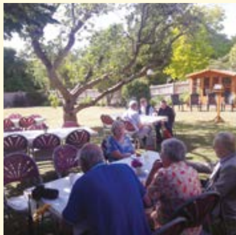
Norton Vicarage Tea