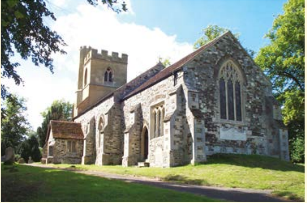
St. Nicholas, Hockliffe: Drainage repairs