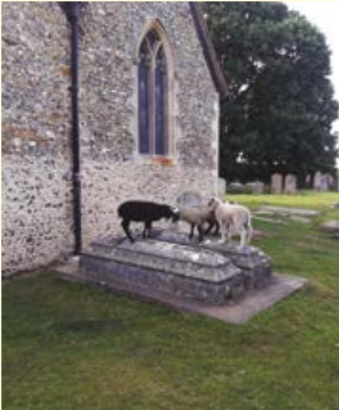
St. Giles Codicote, where Trustees meet to award grants

All income and expenditure derives from continuing activities.