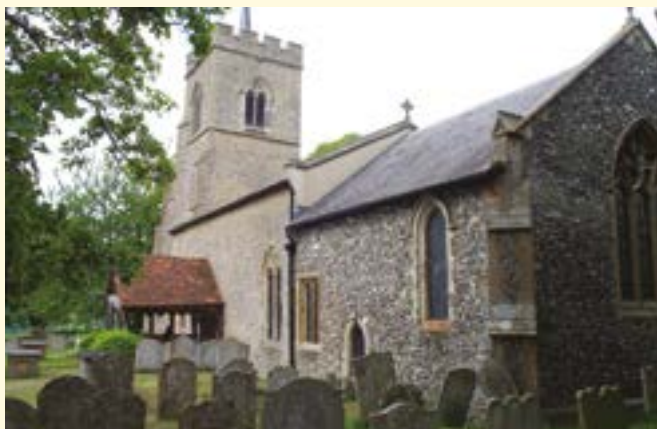
St. Cecilia, Little Hadham