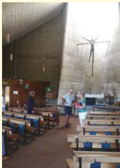
St. George, Norton