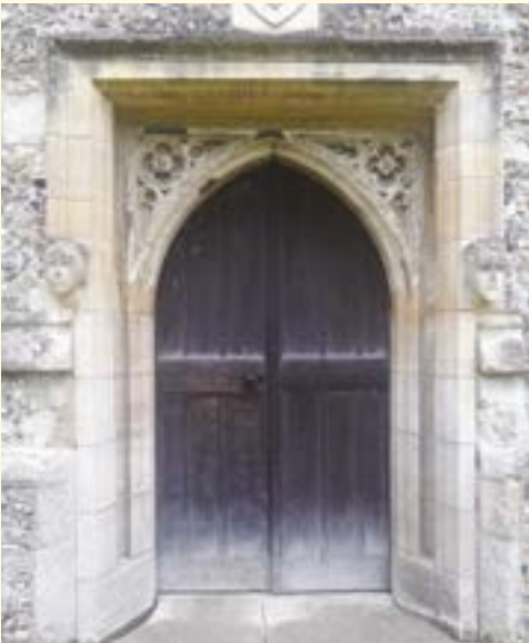
St. Andrew Much, Hadbarnham: Henry Moore carvings