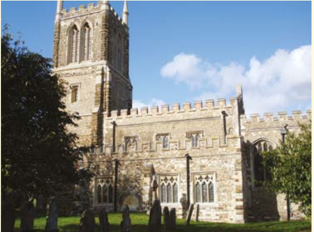
St. John the Baptist, Cockayne Hatley: Parapet repairs