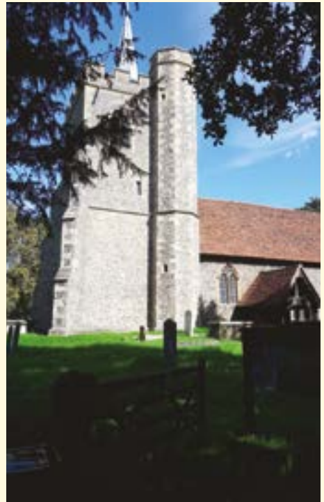
Stanstead Abbots, St. James