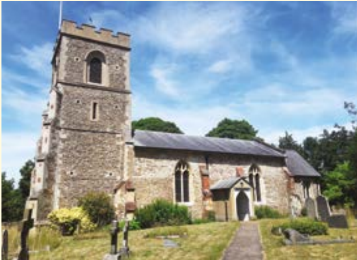
St. Nicholas, Norton