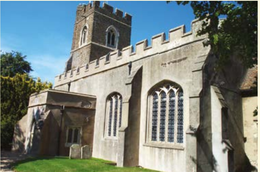
St. Mary Harlington: Porch and south aisle repairs