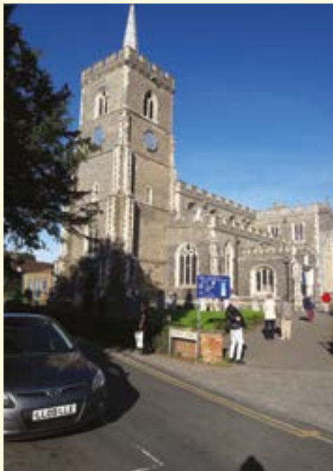
St. Mary, Ware